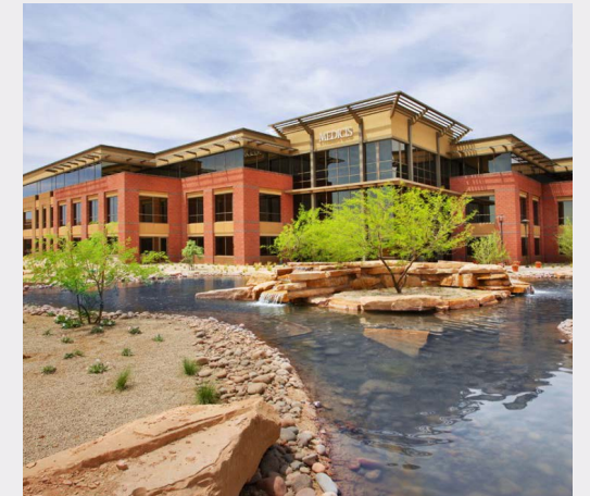
RIOGLASS SOLAR INC. Surprise, Arizona