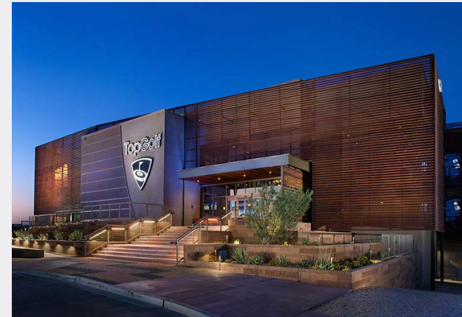
TOPGOLF SCOTTSDALE Scottsdale, Arizona