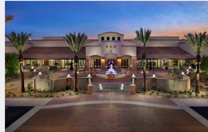
SCOTTSDALE PRINCESS BALLROOM EXPANSION Scottsdale, Arizona