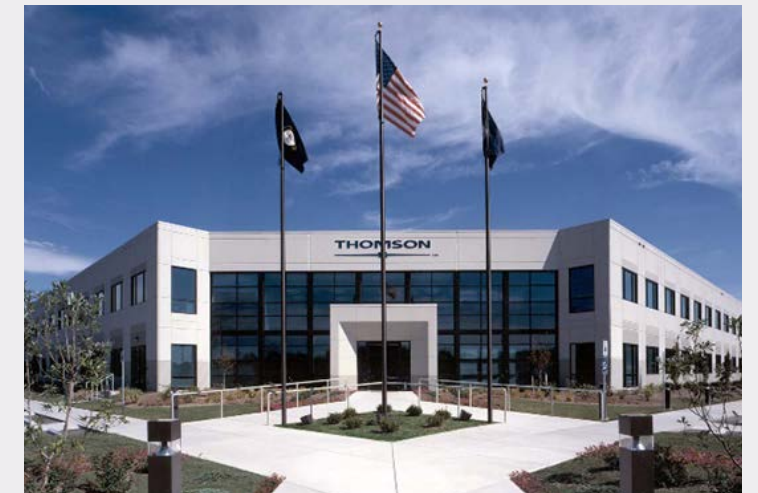
THOMSON LEARNING Independence, Kentucky