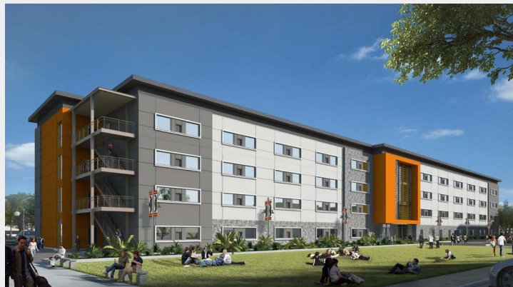
OUAZ STUDENT HOUSING/UNION/DINING HALL Surprise, Arizona

The NOVO team is comprised of experts from all facets of the development process. Our goal is to produce value for the client. By balancing out the competing elements of design, cost and schedule, our buildings are designed to maximize our client's investment.