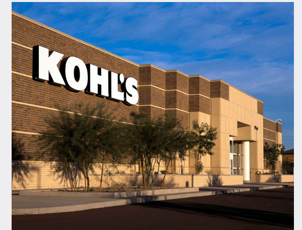
KOHL'S DEPARTMENT STORE Chandler, Arizona