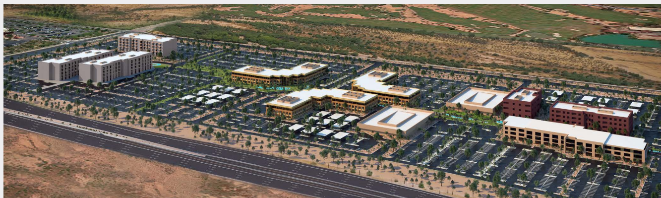
RIVERWALK AT TALKING STICK MIXED-USE BUSINESS PARK Scottsdale, Arizona

We invest in real estate and land development projects that provide the opportunity to create and capture value. Our focus is to advise our clients and to find investment opportunities that minimize risk while enhancing capital returns. We currently represent multiple development encompassing over 3,000 acres of land in the Phoenix Metropolitan Area. Our partners/clients look to NOVO to determine how to increase the value through the development process.