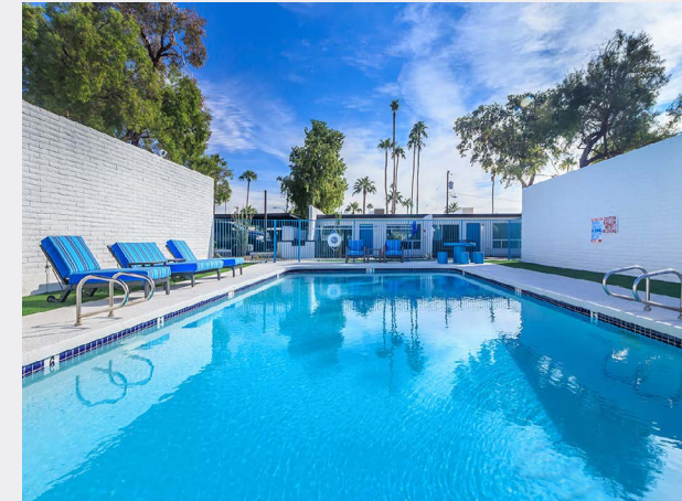
REZIDE UPTOWN Phoenix, Arizona