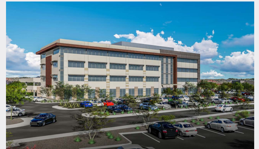
SIERRA BLOOM MEDICAL OFFICE BUILDING Scottsdale, Arizona