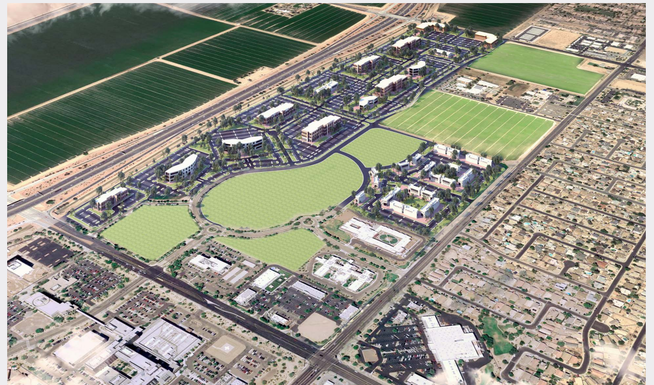
ALGODON MIXED-USE BUSINESS PARK Phoenix, Arizona