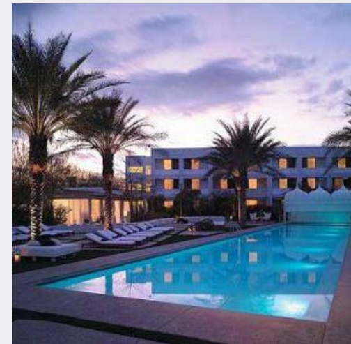
THE MONDRIAN HOTEL Scottsdale, Arizona