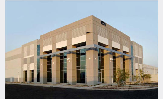
BUCKEYE LOGISTICS CENTER Phoenix, Arizona