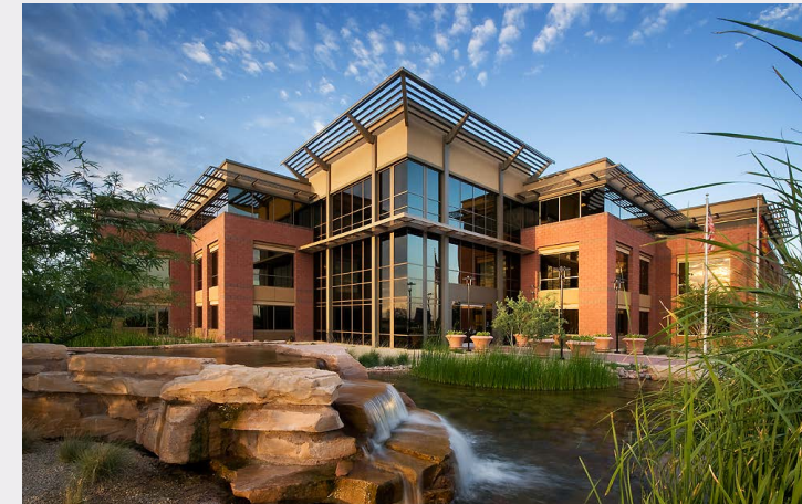
MEDICIS PHARMACEUTICALS HEADQUARTERS Scottsdale, Arizona