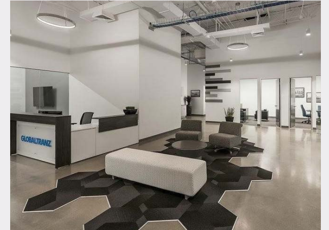
GLOBALTRANZ Scottsdale, Arizona