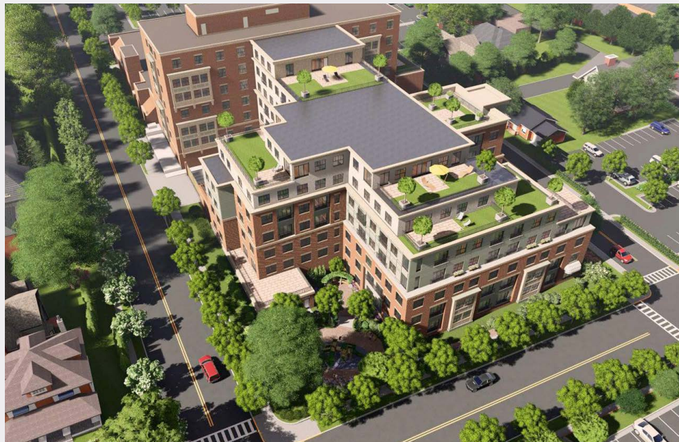
333 CORK STREET Winchester, Virginia

NOVO coordinates and supervises the construction process from the conceptual development stage through final construction, ensuring the project is completed on time, within budget, and with the singular focus of creating value. We provide value engineering, design overview, cost estimating, scheduling, construction management, and project start-up. We focus on precise planning, reducing costs and promoting value.