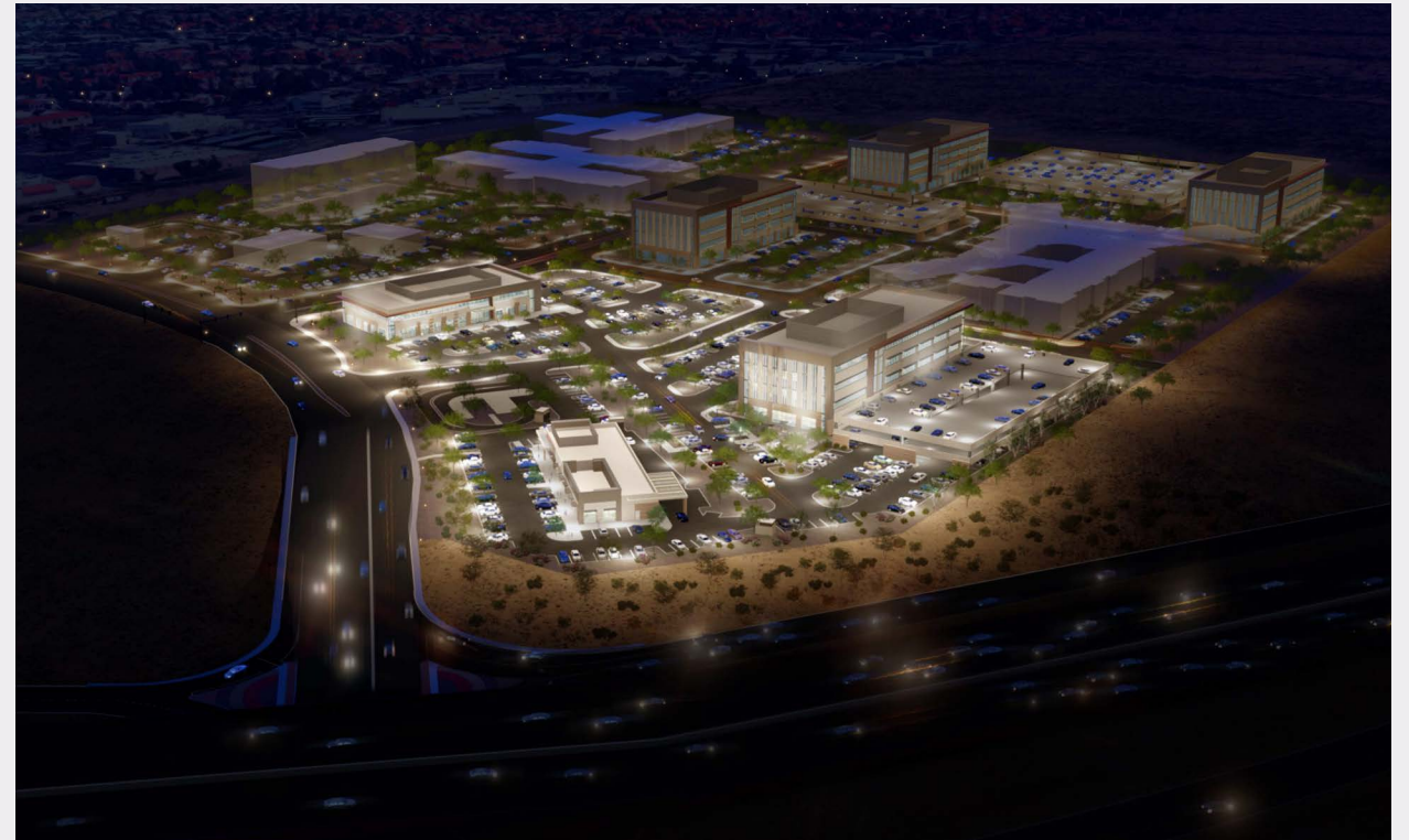
SIERRA BLOOM MEDICAL OFFICE CAMPUS Scottsdale, Arizona